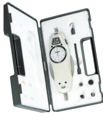
All FB/PS/MF gauges are sold in kit form.

Many ranges are available to cover all of your measurement needs. FB gauges are sold as kits complete with gauge, hard carrying case, five measuring tips (flat head, conical, chisel, notched, and small hook) as well as a 3 inch extension shaft.